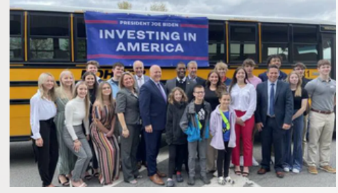
Students and administration pose in front of the EV school Bus for the Clean School Bus Funding Announcement

This NOFO is a competitive solicitation and projects will be scored on many criteria unlike the 1st round which was a rebate competition.